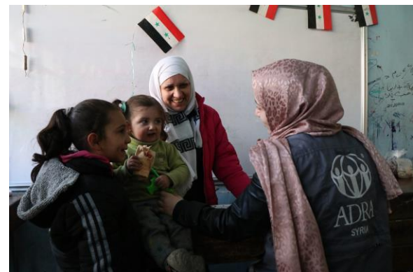
Meal distribution in Aleppo