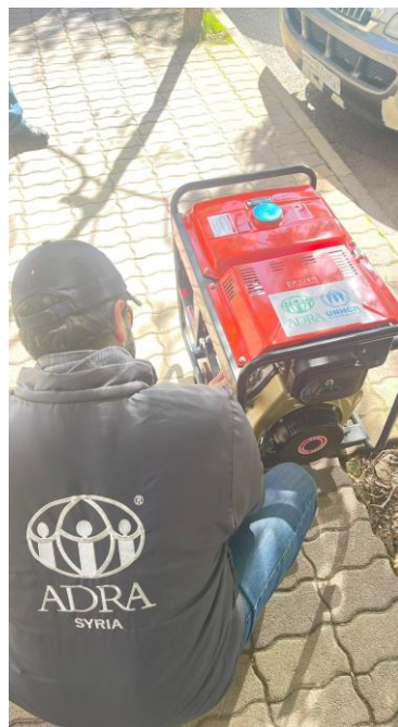
Generator funded by UNHCR, provided by ADRA for the rehabilitation of water networks in Latakia