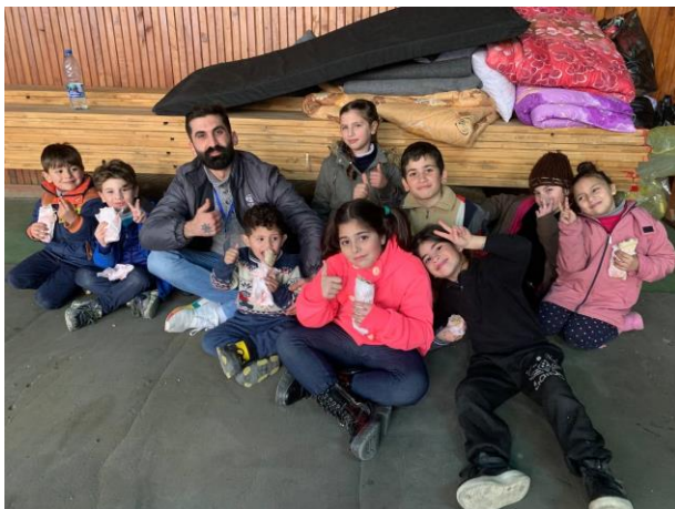
Meal distribution in Sports City shelter in Latakia