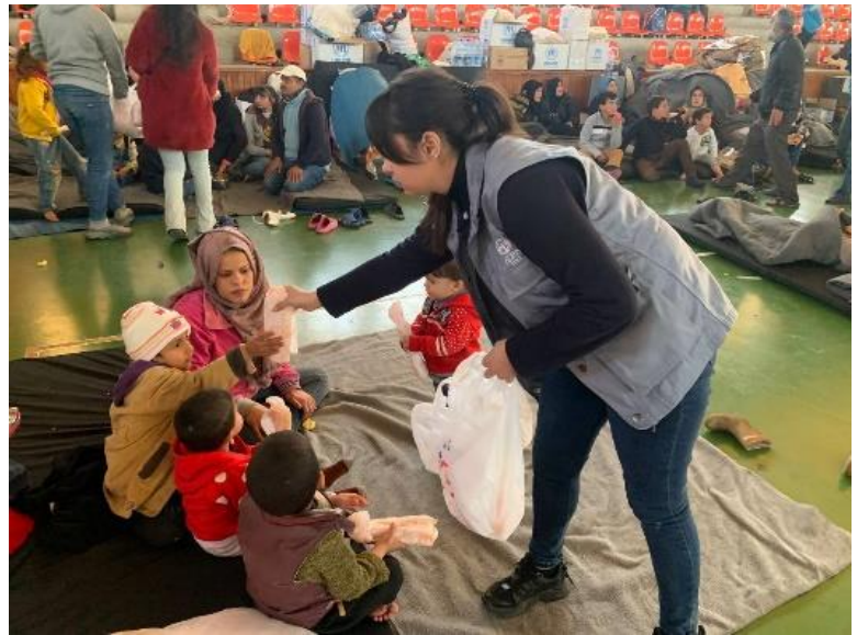
Meal distribution in Sports City shelter in Latakia